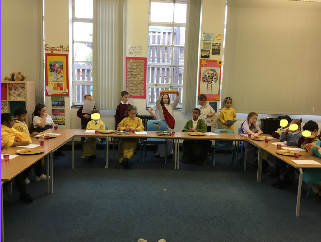
Year 3 Class 7: The Last Supper and Jesus washes the disciples' feet