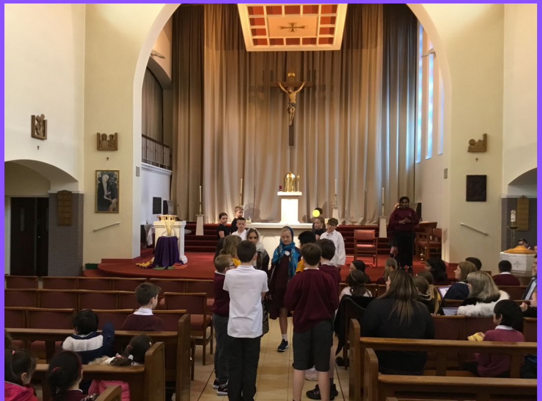
Year 6 Class 14: Jesus is laid in the tomb