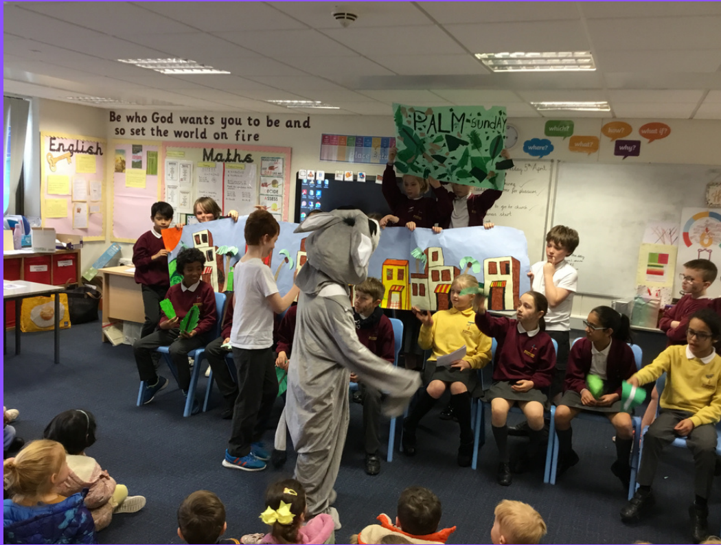
Year 5 Class 12: Palm Sunday - Jesus enters Jerusalem