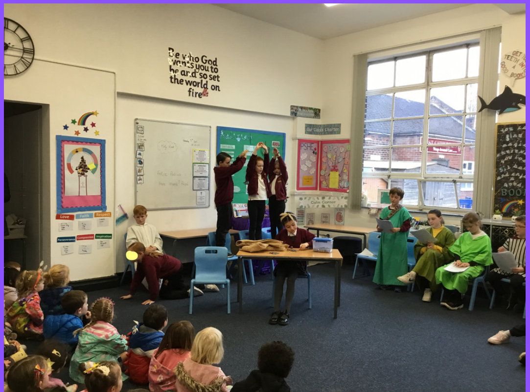
Year 4 Class 9: Jesus clears the temple