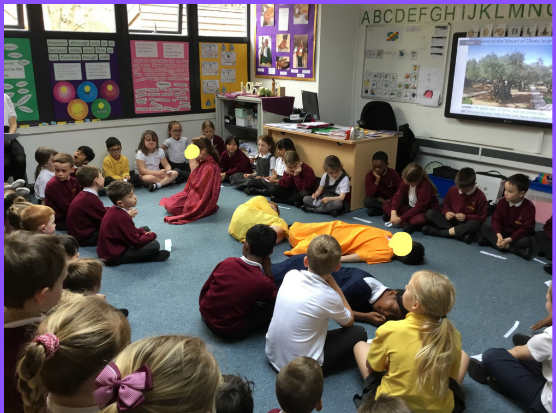
Year 3 Class 8: Jesus goes to the Mount of Olives