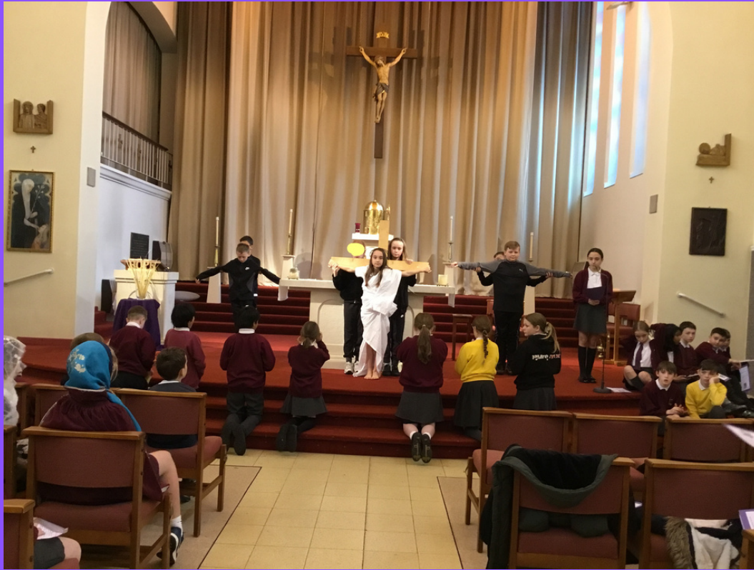
Year 6 Class 13: Jesus' crucifixion