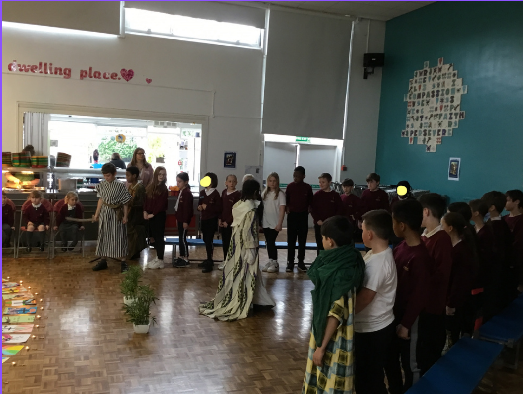
Year 5 Class 11: Garden of Gethsemane and Jesus' arrest